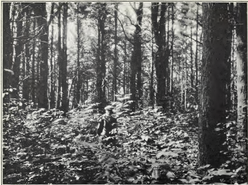
FIG. 1.—A 60-YEAR-OLD WHITE PINE STAND IN WHICH A REPRODUCTION CUTTING WAS MADE THREE YEARS AGO.

[This resulted in an abundant reproduction of both white pine and white ash. Because of its slow growth when very young the pine has little chance of success in competition with the ash, and the latter should be favored.]